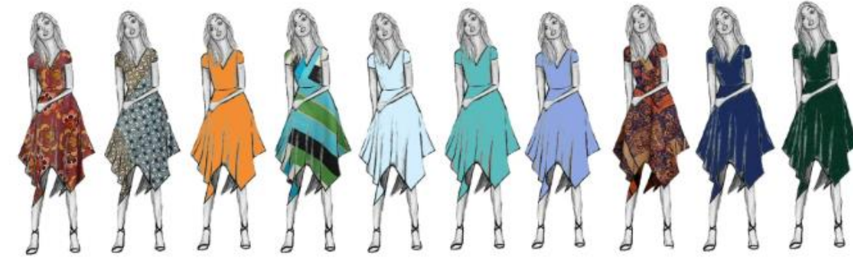
Resort Collection Graphite, photoshop 8"x11" Jaline, 2023