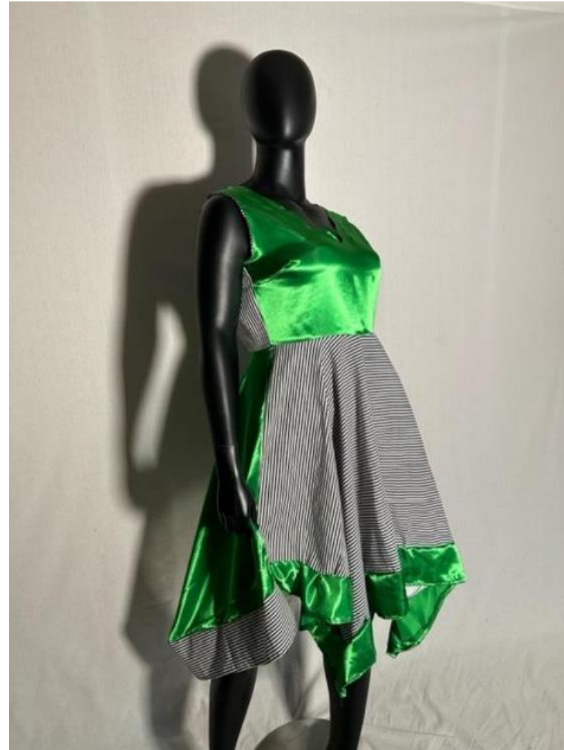
Emerald Illusion Silk and cotton ATD 323, 2023