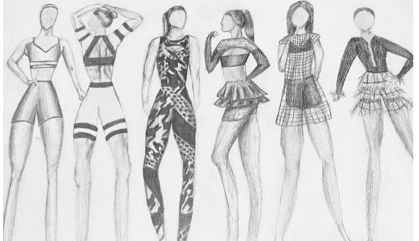
Fancy Athletic Wear Graphite 11"x9" ATD 121, 2022