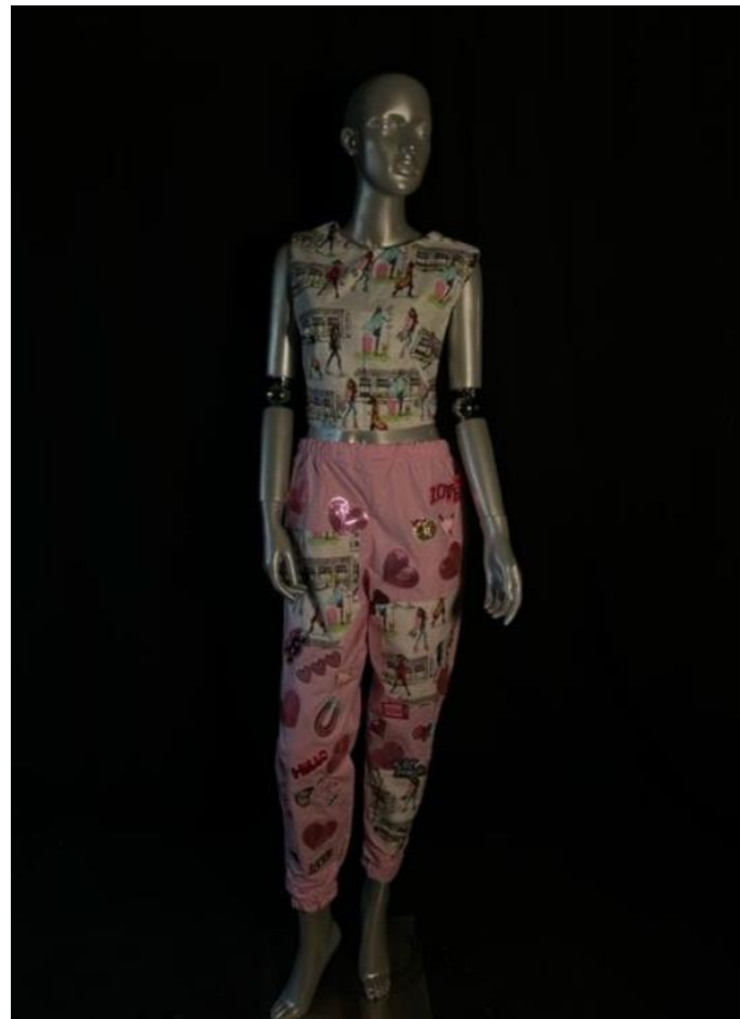
Sticker Book Cotton ATD 323, 2023