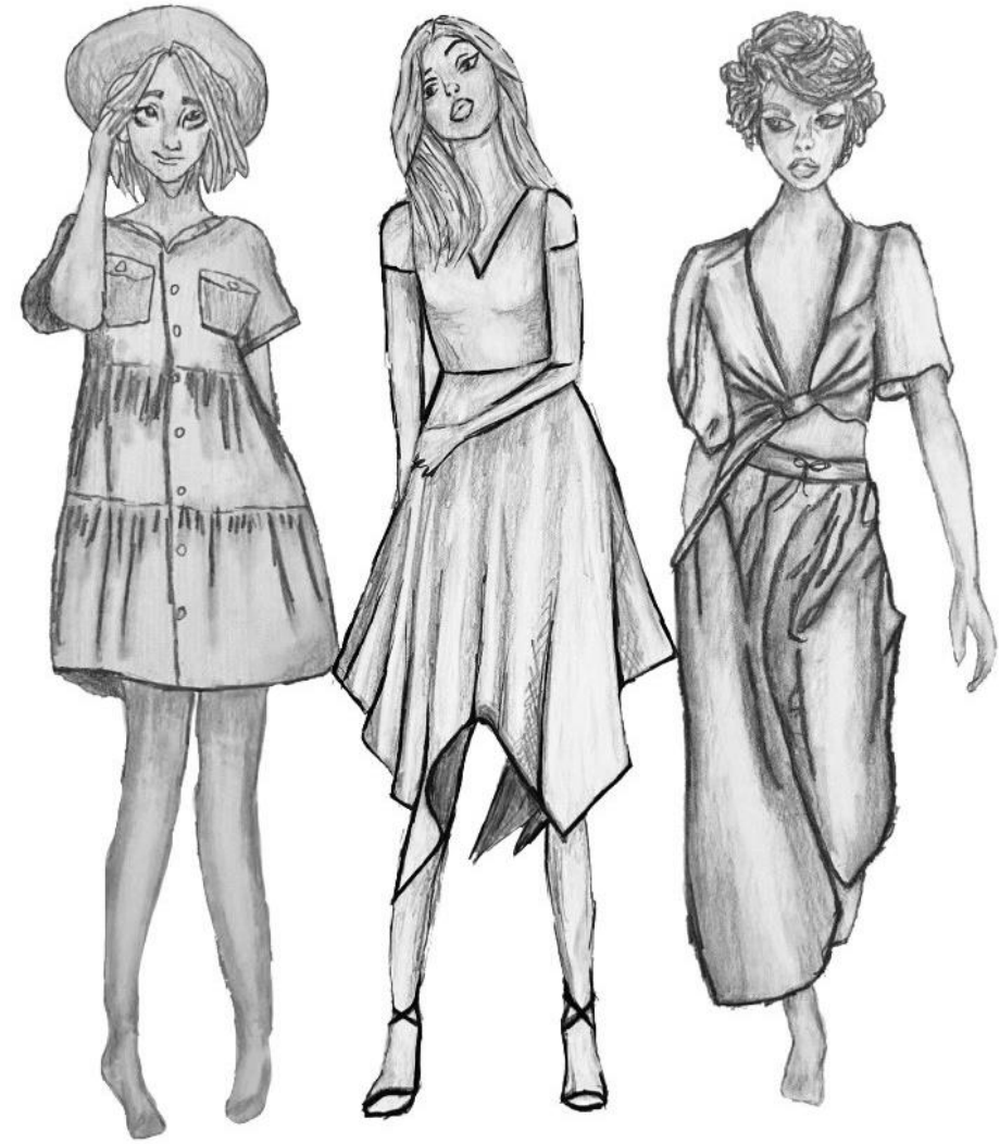
Resort Collection Part 1 Graphite 8"x11" Jaline, 2023