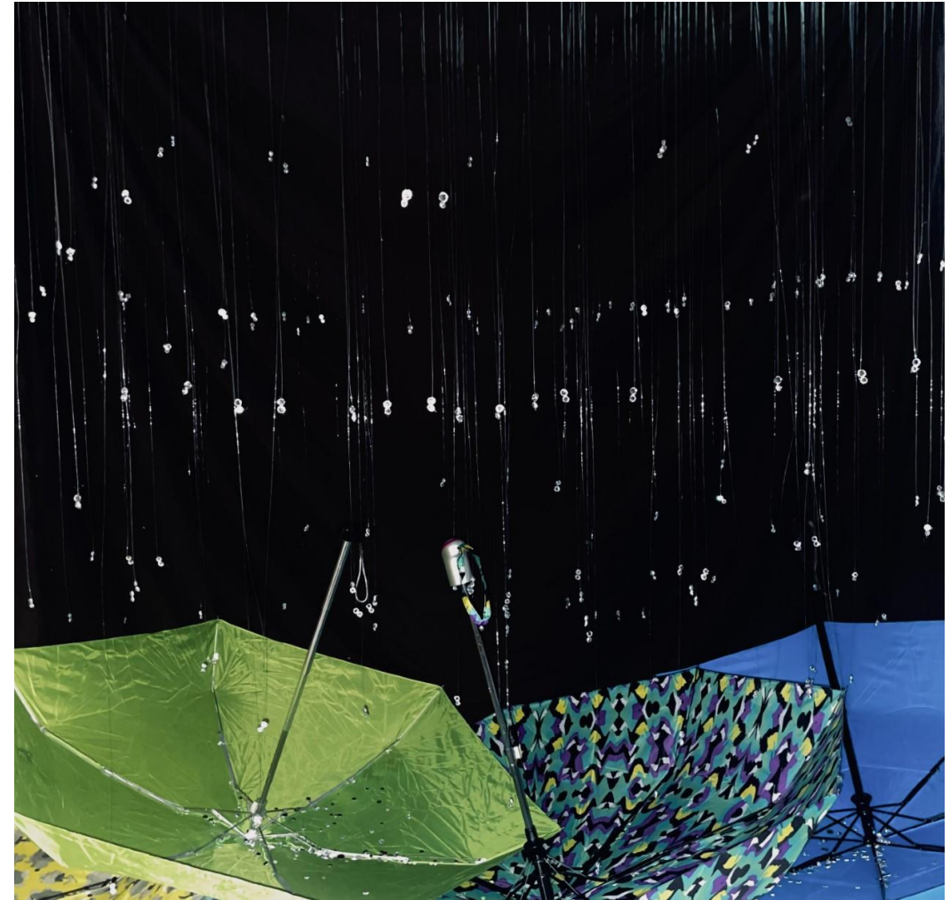
Memories are like Raindrops Fish line, rhinestones, hot glue 7'x6' STA 114, 2022