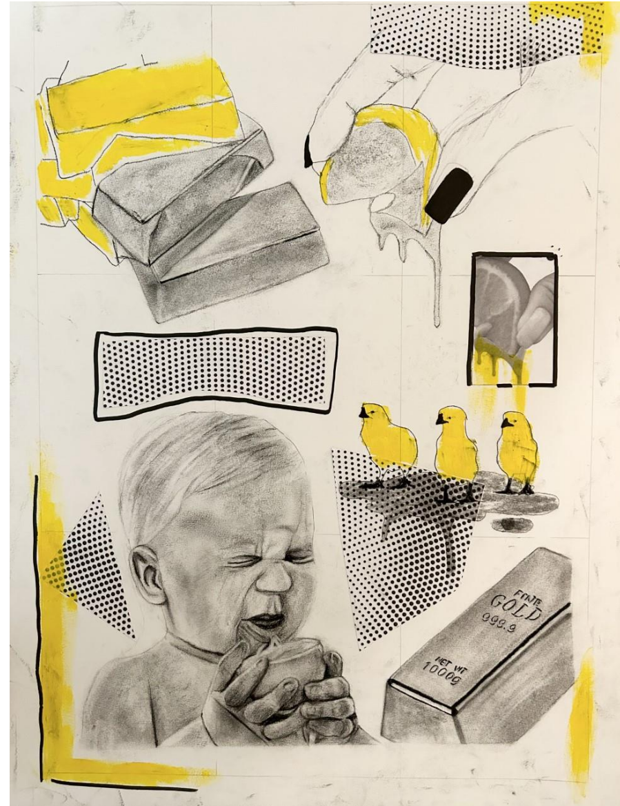
The Luxuries of Fruit Acrylic Paint and charcoal 18"x 24" STA 391, 2023